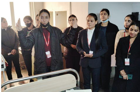
Maternal Health Awareness