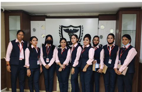
Soft Skills Training